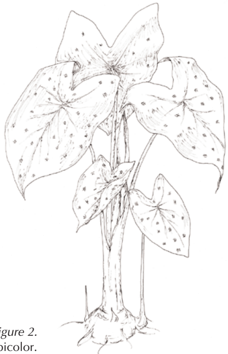
Figure 2. Caladium bicolor .

The second most important group is the aroid ornamentals. In future, aroid ornamentals will probably become more important. The Araceae family represents a unique source of variation which has not yet been fully explored. Most of the species can be considered as ornamentals because of their specific (exotic) leaves or inflorescences. With modern techniques of breeding, it may be possible to create additional variability and select specific genotypes according to market requirements. There are many economically important aroid ornamentals. The most important genera are Aglaonema , Alocasia , Anthurium , Caladium (Figure 2), Dieffenbachia , Philodendron , Scindapsus and Zantedeschia . Besides root crop species and ornamentals, the Araceae family also includes vegetables, species with edible fruits ( Monstera deliciosa ) and medicinal plants, such as sweet flag ( Acorus calamus ).