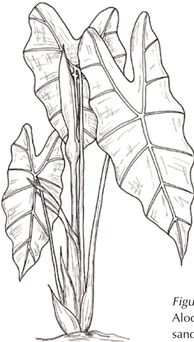
Figure 3. Alocasia sanderiana .

Alocasia species have sagittate leaves. However, there is tremendous variability, especially among Alocasia species. Blades of some Alocasia species can be pinnatifid ( A. brancifolia ) or even peltate ( A. sanderiana , Figure 3).